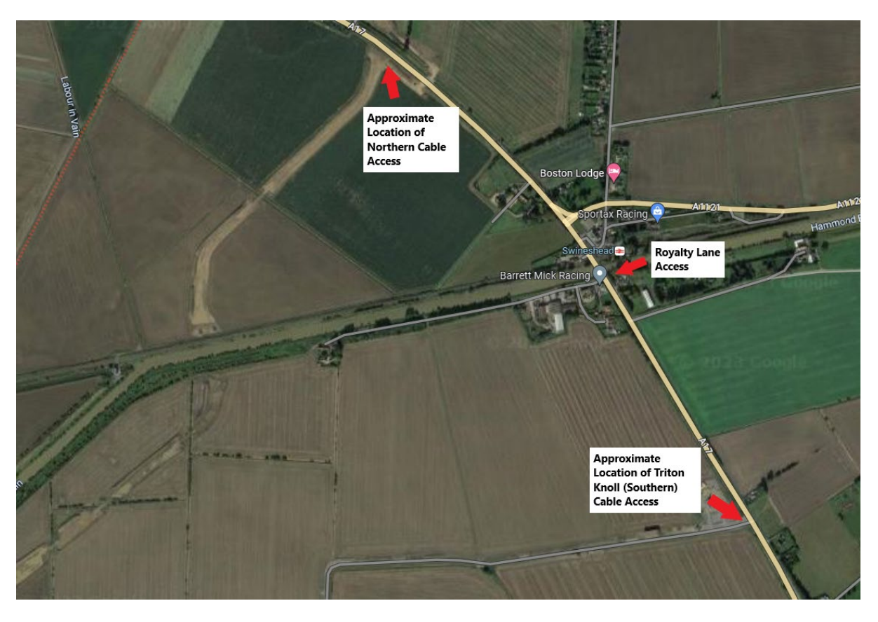
Plate 6.1 – Proposed Off-Site Cable Corridor Access Locations

National Grid Bicker Fen Substation Extension